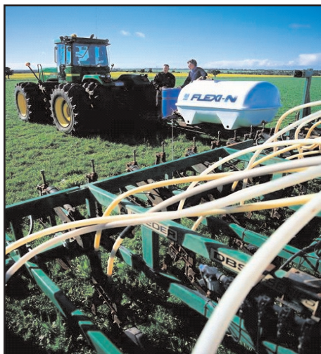
In-furrow Intake® can be mixed with Flexi-N and banded at sowing